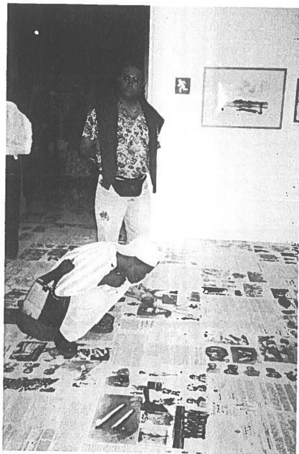
Left: Plate 4: Visitors examine the gruesome details underfoot at the Miscast exhibition, Cape Town.